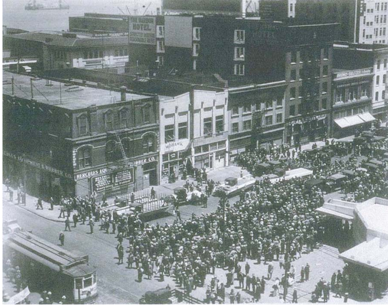
Funeral Preparations, Morning, July 9, 1934, 113 Steuart St., flatbed trucks to carry caskets being prepared