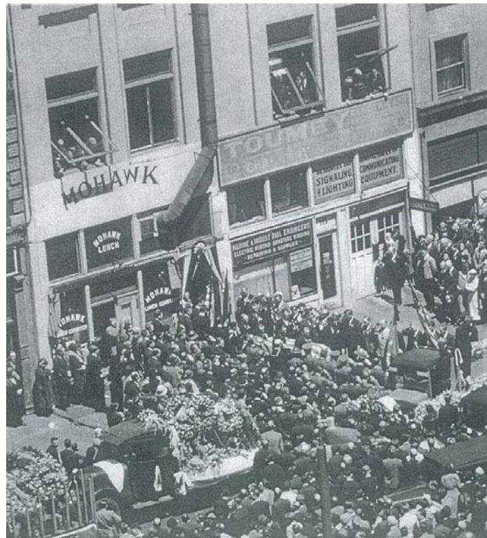
Noon, July 9, 1934, Spectators looking down from inside the ILA Headquarters while the flag draped caskets are moved to the truck from the draped entry.